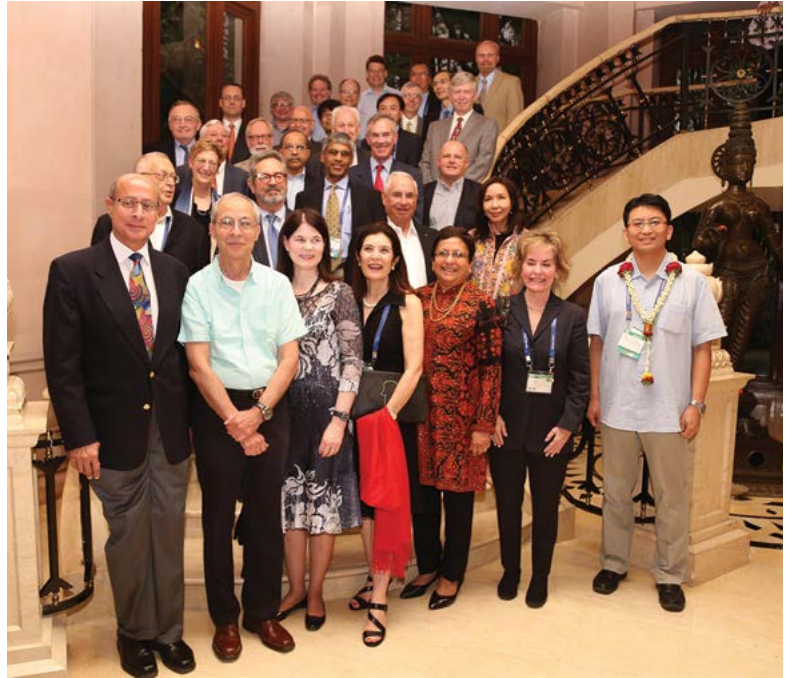
AIB Fellows gather during the AIB 2015 conference

T he AIB Fellows is a distinguished group of AIB members recognized for their contributions to the scholarly development of the field of international business. The AIB Fellows participate in the activities of the AIB by choosing the International Educator of the Year , International Executive of the Year and Eminent Scholar awardees annually. The Fellows also organize one or more panel sessions at the AIB annual meeting each year — often the first Plenary Panel. The Academy warmly welcomes the following newly inducted members elected to join the AIB Fellows in 2015: