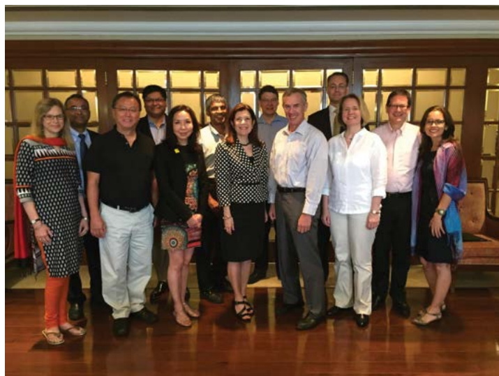
AIB Executive Board Members during a meeting break in Bengaluru, India

Nominations (including self-nominations) for any of these positions should be sent to the Secretariat at aib@aib.msu.edu , by October 31, 2015 . Please note that AIB has a published policy regarding election campaigning. The policy can be read at http://aib.msu.edu/aboutcampaigning.asp